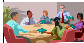
NYSPPSA FIRST ANNUAL CONFERENCE JUNE 24-26, 2005

goes on. There will be an educational seminar at the convention for those who wish to obtain the coveted title of New York Certified Process Server (NYCPS)